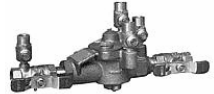
Reduced Pressure Backflow device

The type of protection required is based on the potential for backflow and the degree of hazard to the public water supply.